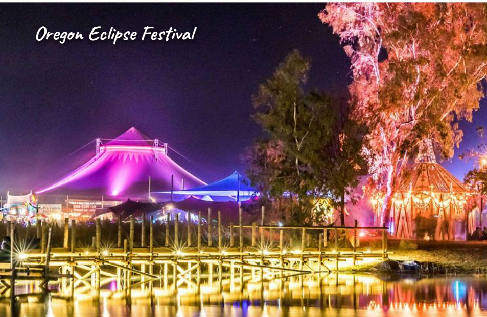
Oregon Eclipse Festival