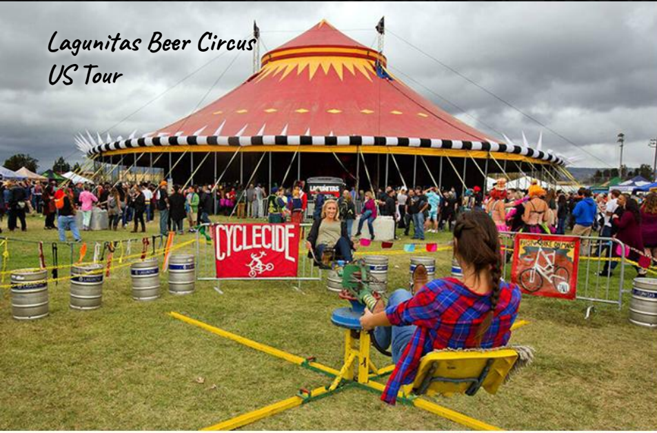
Lagunitas Beer Circus US Tour