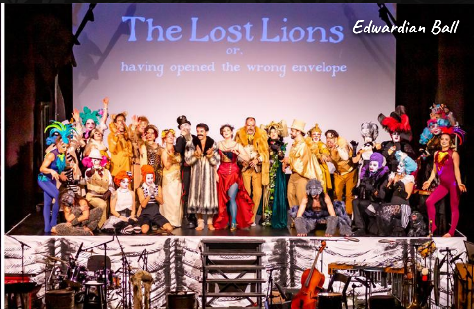
The Lost Lions Edwardian Ball or, having opened the wrong envelope