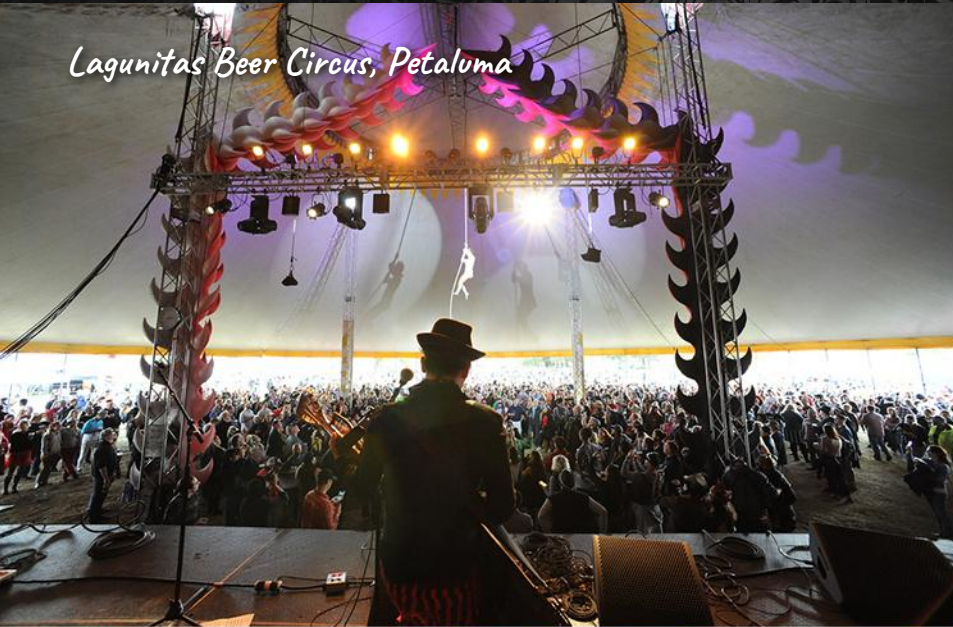
Lagunitas Beer Circus, Petaluma